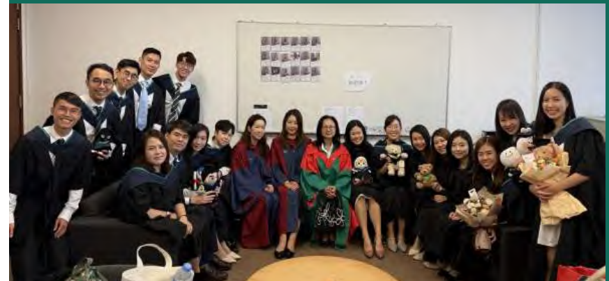
Graduates from the cohort 2022-2024